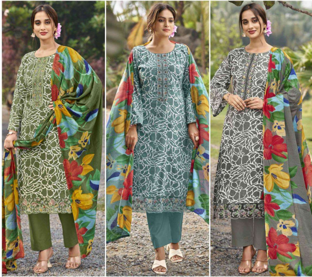
Code # 1001