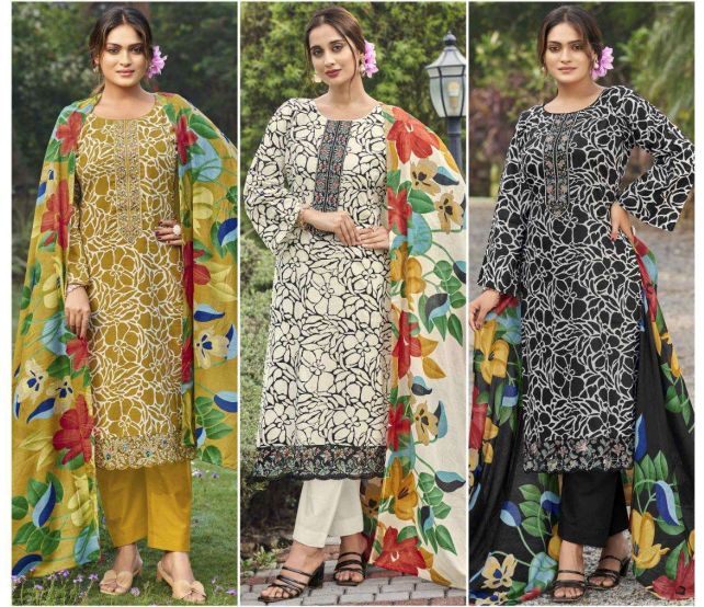
Code # 1004